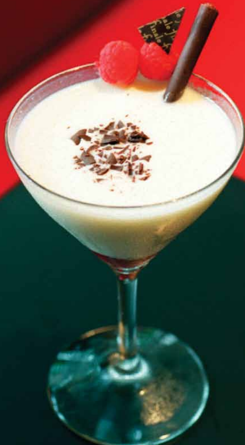
White Chocolate Martini

You'll love our signature collection of drink recipes made with premium chocolate, delicious fruit purees and the finest spirits.